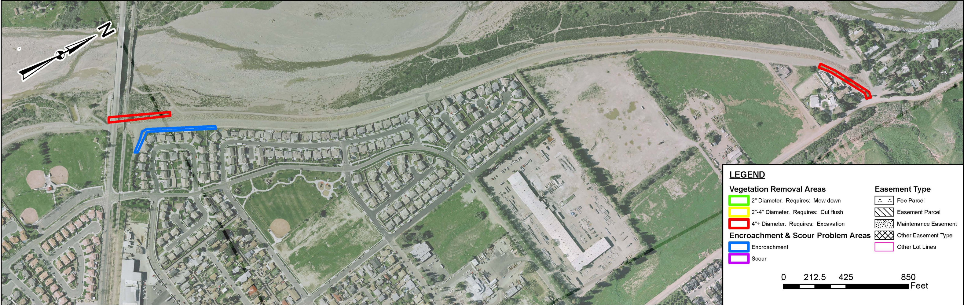
SESPE CREEK LEVEE (SC-1)